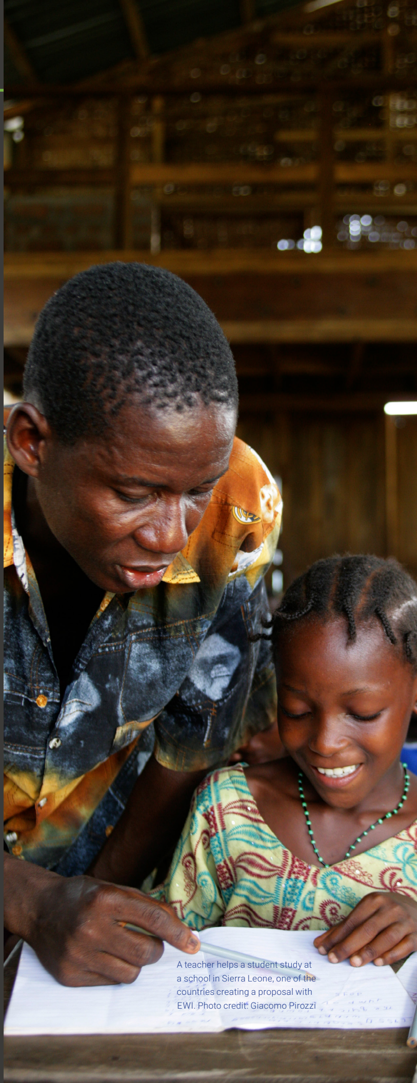
A teacher helps a student study at a school in Sierra Leone, one of the countries creating a proposal with EWI.

Through these two elements, the initiative aims to build local and international capacity in this critical area of education. 49