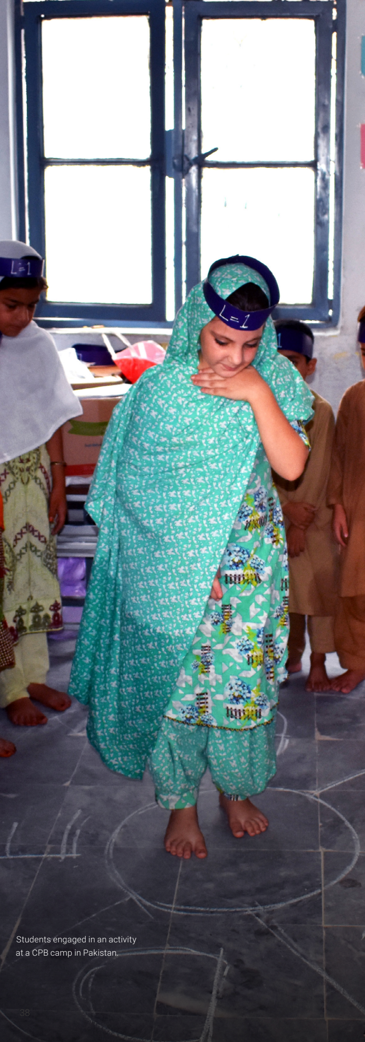
Students engaged in an activity at a CPB camp in Pakistan.

Below, we highlight some of the strongest areas of alignment with the criteria for effective knowledge sharing and a potential area of focus as the program continues to mature.