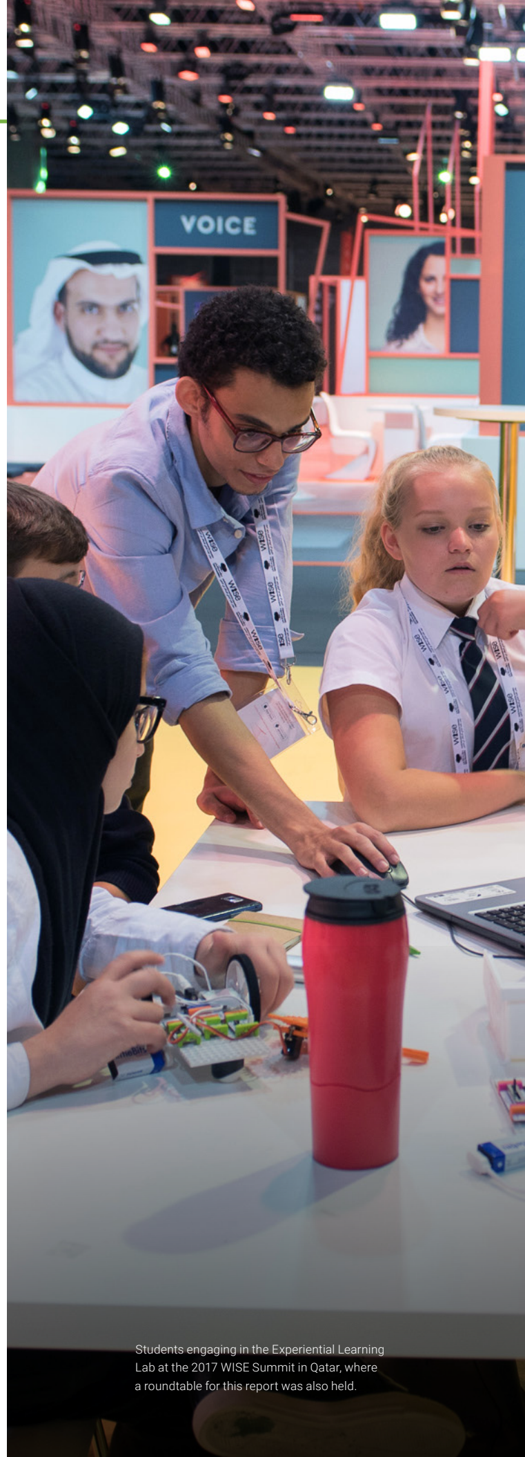
Students engaging in the Experiential Learning Lab at the 2017 WISE Summit in Qatar, where a roundtable for this report was also held.

While our consultations led to a different classification of networks (as a complement to global public goods rather than as global public goods themselves), our conclusion is the same: Networks play a “key role in overcoming constraints” to knowledge sharing. 38