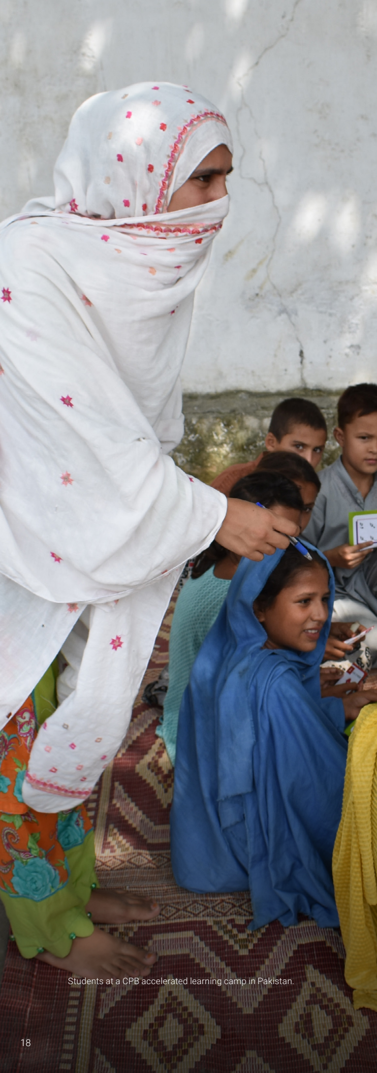
Students at a CPB accelerated learning camp in Pakistan.