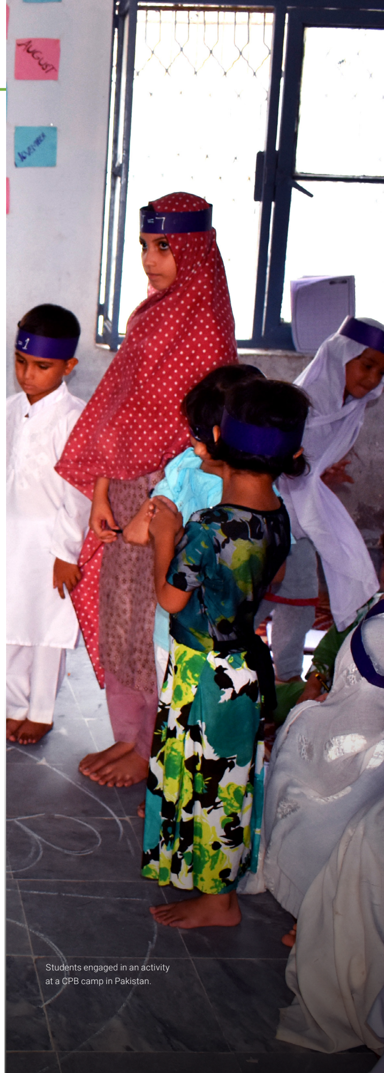
Students engaged in an activity at a CPB camp in Pakistan.

Finally, CPB's partnership and engagement with the provincial Departments of Education are crucial investments in the long-term sustainability of the program. By proactively developing long-term partners