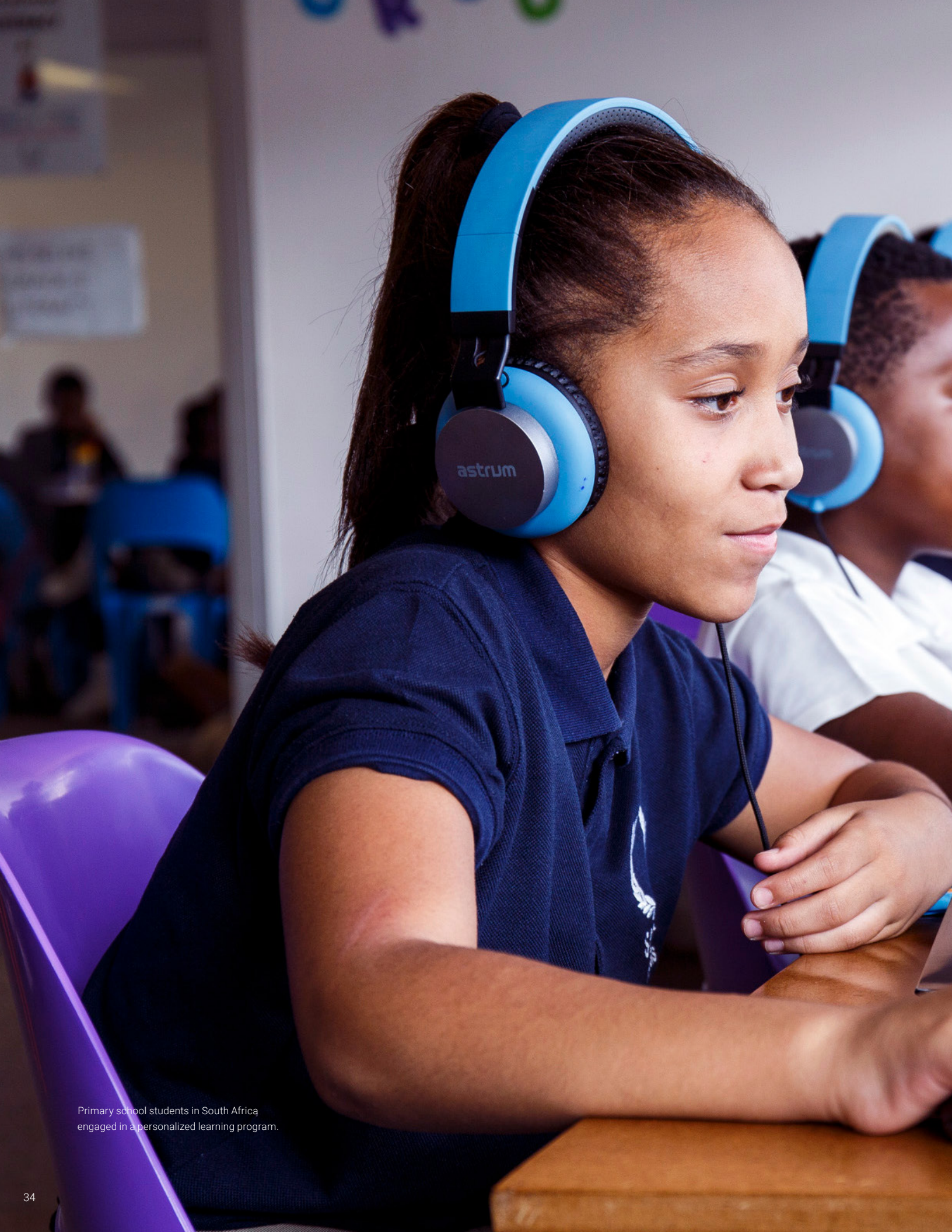
Primary school students in South Africa engaged in a personalized learning program.