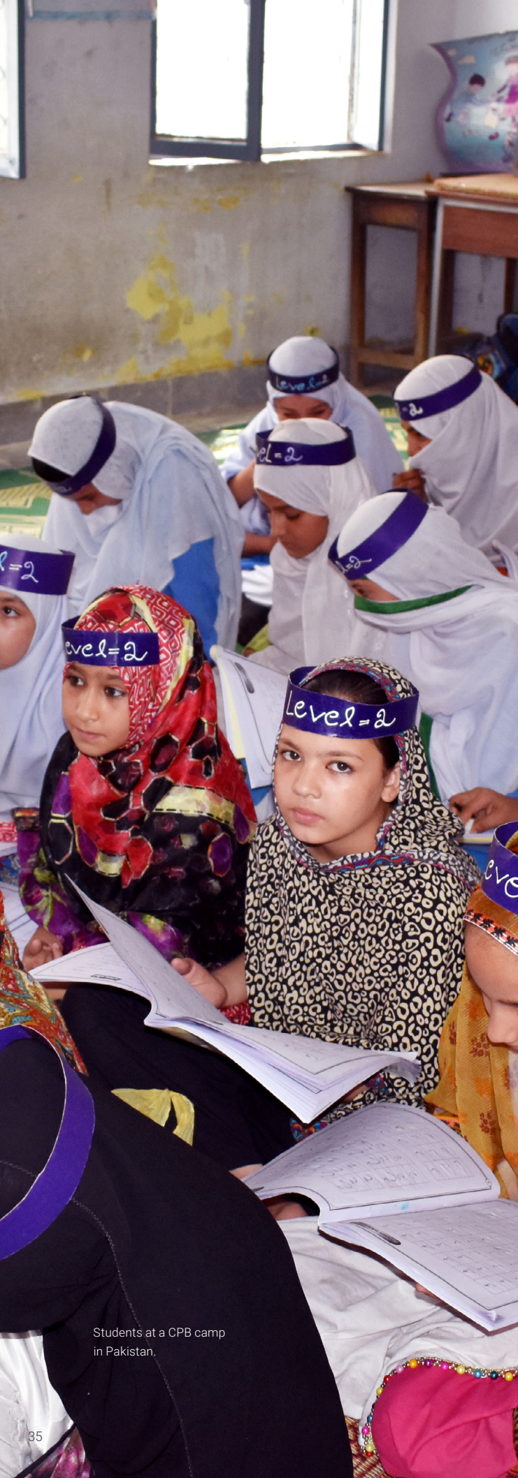
Students at a CPB camp in Pakistan.