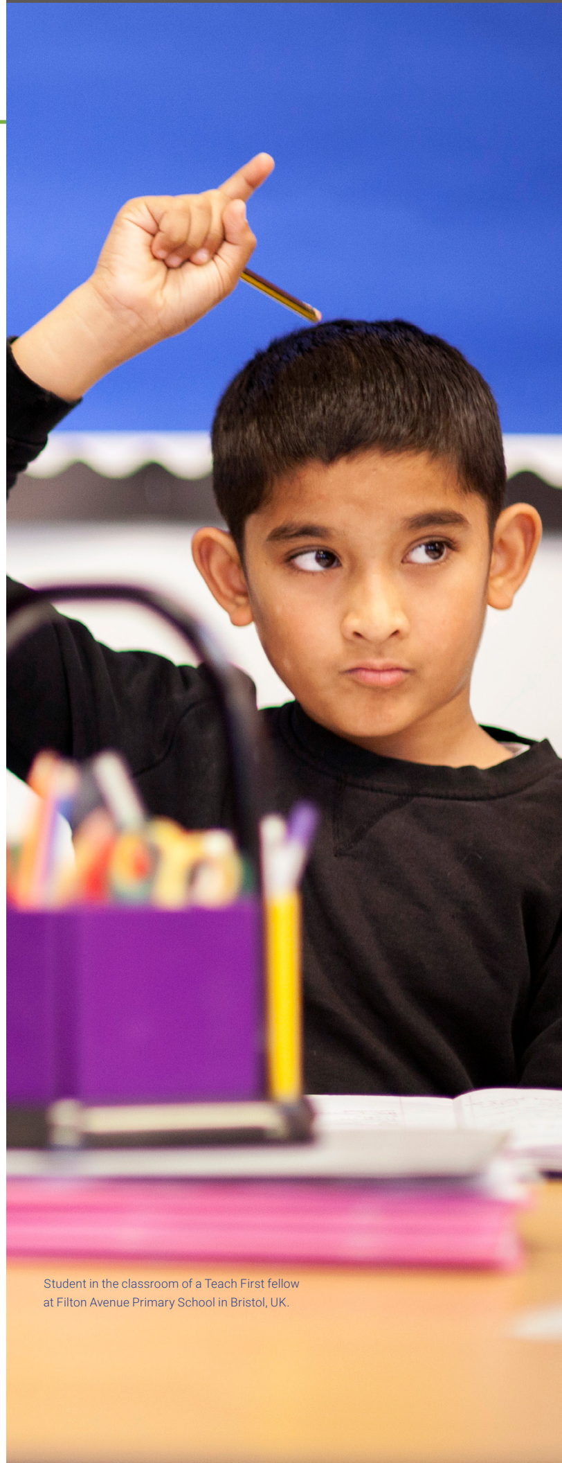
Student in the classroom of a Teach First fellow at Filton Avenue Primary School in Bristol, UK.

More and better investment is needed in the elements of knowledge sharing infrastructure. Funders of knowledge sharing must recognize that inherently longer time horizons and more indirect impact metrics should not disqualify sustained investment in these activities. As examples from other sectors show, investments in knowledge sharing can yield significant long-term results. In the short term, this means funders in education may need to adjust their investment strategies to more highly prioritize knowledge sharing.