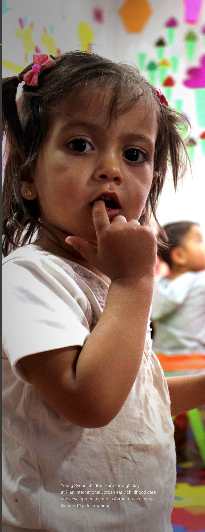
Young Syrian children learn through play at Plan International Jordan early childhood care and development center in Azraq refugee camp.