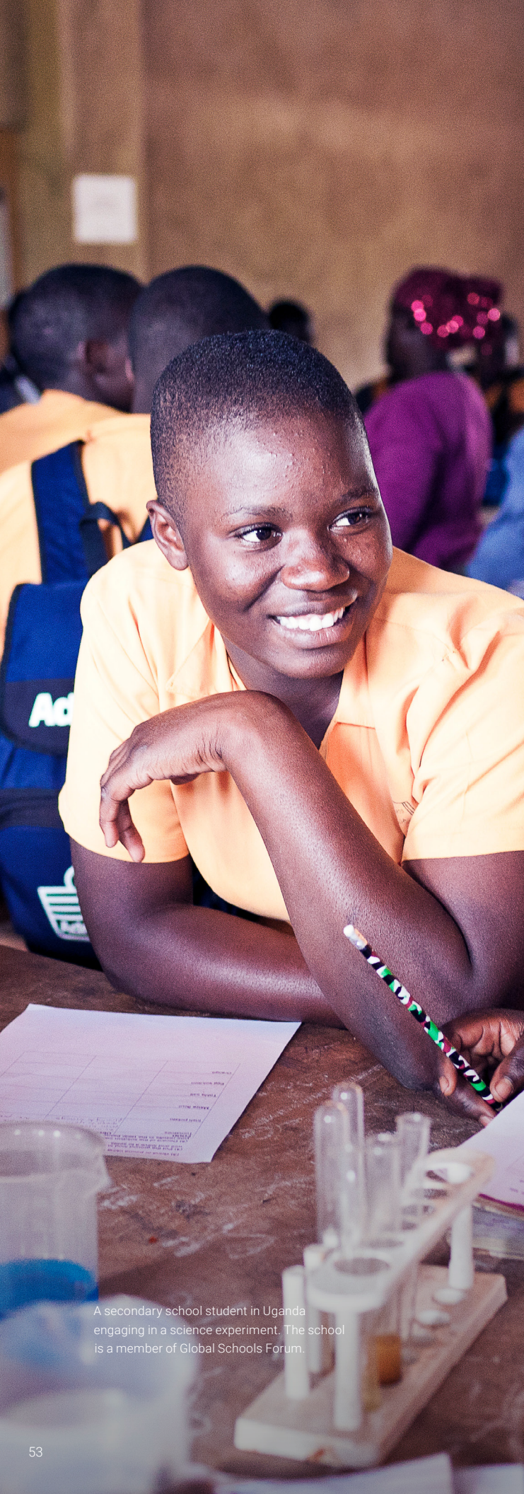
A secondary school student in Uganda engaging in a science experiment. The school is a member of Global Schools Forum.