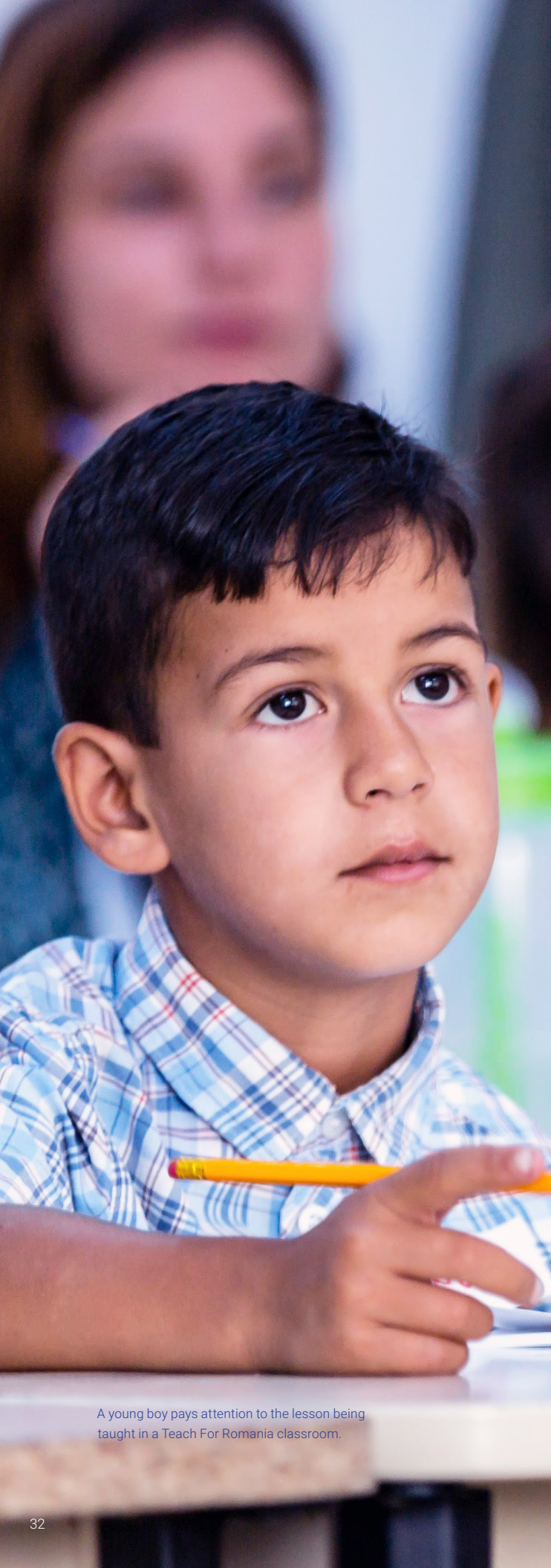
A young boy pays attention to the lesson being taught in a Teach For Romania classroom.