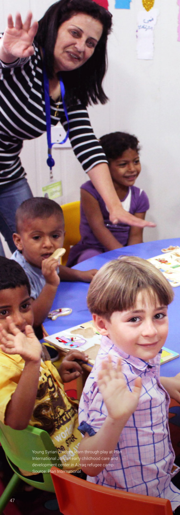
Young Syrian children learn through play at Plan International Jordan early childhood care and development center in Azraq refugee camp.