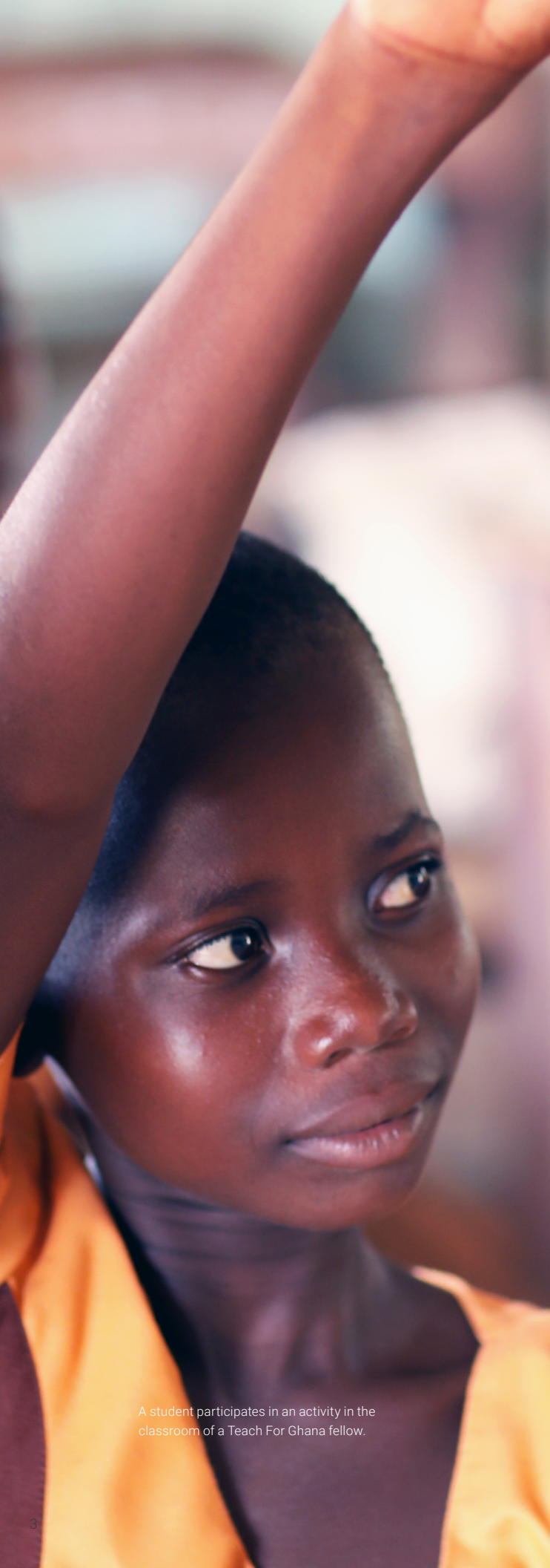
A student participates in an activity in the classroom of a Teach For Ghana fellow.

Second, it is now abundantly clear that the returns to well-deployed investments in human capital can be very high. A generation ago at the World Bank, I argued that investment in primary education for girls might well be the highest return investment available in the developing world. 2 Yet too often, spending on health and education is seen as consumption rather than investment. A wide range of studies using randomized controlled trials have confirmed that well-designed educational and health interventions can have very large impacts. It is also clear that the spending itself must be well designed to be effective.