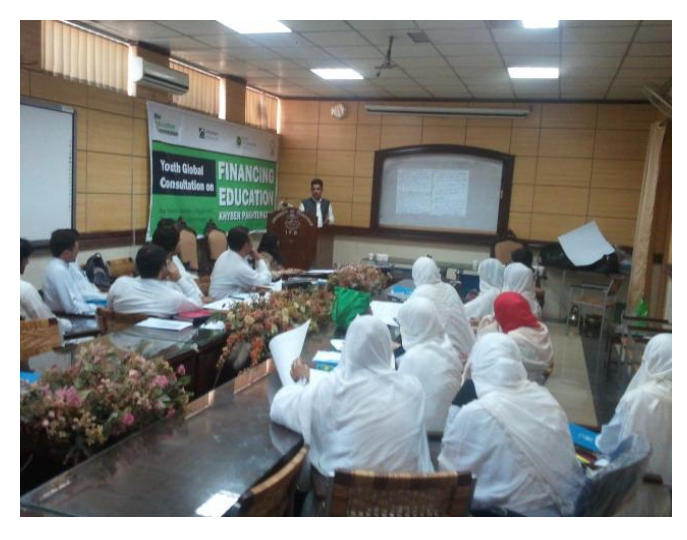
Students from IER, UoP presenting their group recommendations